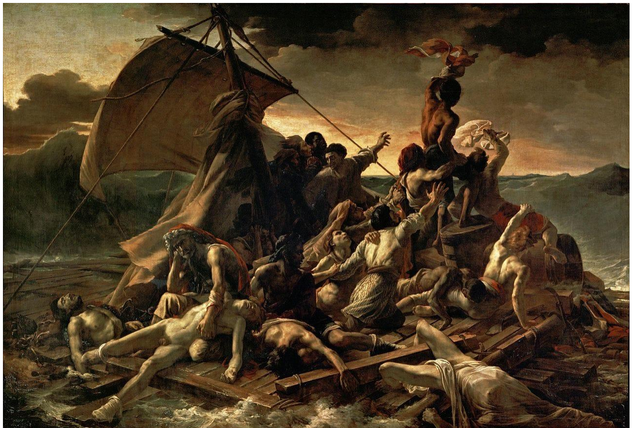
Painting 6. The Raft of the Medusa Géricault 1819.

Nevertheless the frustration is still there and it grows each year, frustration with my own life as much as with the lives of my students and my children. Frustration with how wrapped up I get with small unessential things, with how difficult it is to keep my focus on the vision of how I am meant to live, a vision which hangs there like a small ship on the distant horizon and fills me with hope that I will soon be rescued, but then comes an unexpectedly fearsome wave, and after a great struggle with that, I search for the ship again and find that it has slipped from sight.