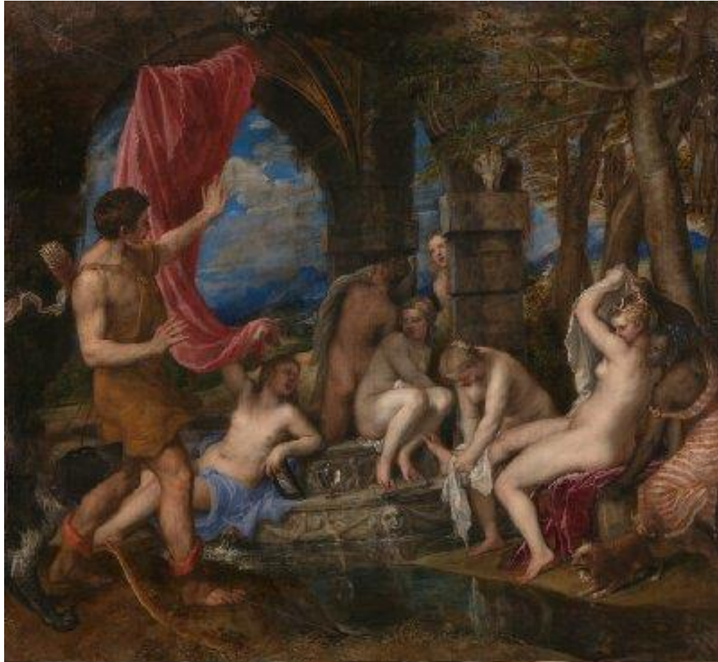
Painting 1. Diana and her nymphs surprised by Actaeon . Titian 1550

Females nudes have been a favorite subject of artists for centuries, and this 1550 painting by Titian is a typical example of the classic form. It's a very inviting picture--you'd love to be there. It has a familiarity too, it's exactly how you'd expect it to be, how you'd want it to be.