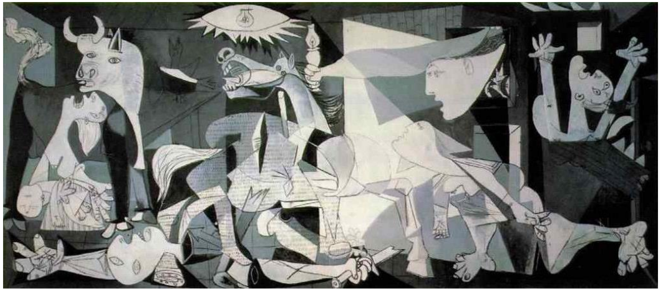
Painting 5. Guernica. Picasso 1937.

In the afternoon of April 26, 1937, German bombers, flying for Franco, annihilated the defenseless Spanish town of Guernica. The centre of the Basque cultural tradition, it was situated far behind the lines. For over three hours, a powerful fleet of bombers and fighters circled and wheeled over the town, dropping thousands of bombs, and setting everything on fire. The fighters then dropped low to spatter with machine gun fire those who had fled to the fields.