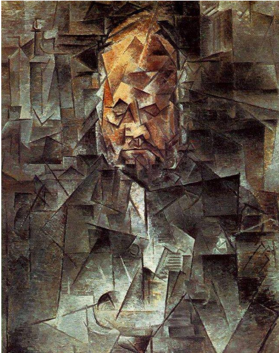
Painting 3. Portrait of Ambroise Vollard. Picasso 1910

Art must reshape experience and present a new kind of reality--that was the heedy concept that drove Picasso and the new cubism movement forward. In this 1910 portrait of the famed art dealer Ambroise Vollard, the image is broken into myriad facets which are then reassembled with a new sense of form, space and coherence. The intersecting slabs replace a normal 3-dimensional portrait with a flat mosaic, that, with its intersecting lines and corners, vibrates with life but is held firmly in place. In spite of the reorganization, the identity of the sitter is perfectly recognizable--in fact the form appears to emphasize the dynamic but shrewdly magisterial character of the man. One of the things I find interesting about this painting is that it looks like something that we could do with ease with computer graphics nowadays. Though I doubt that we could make a Vollard.