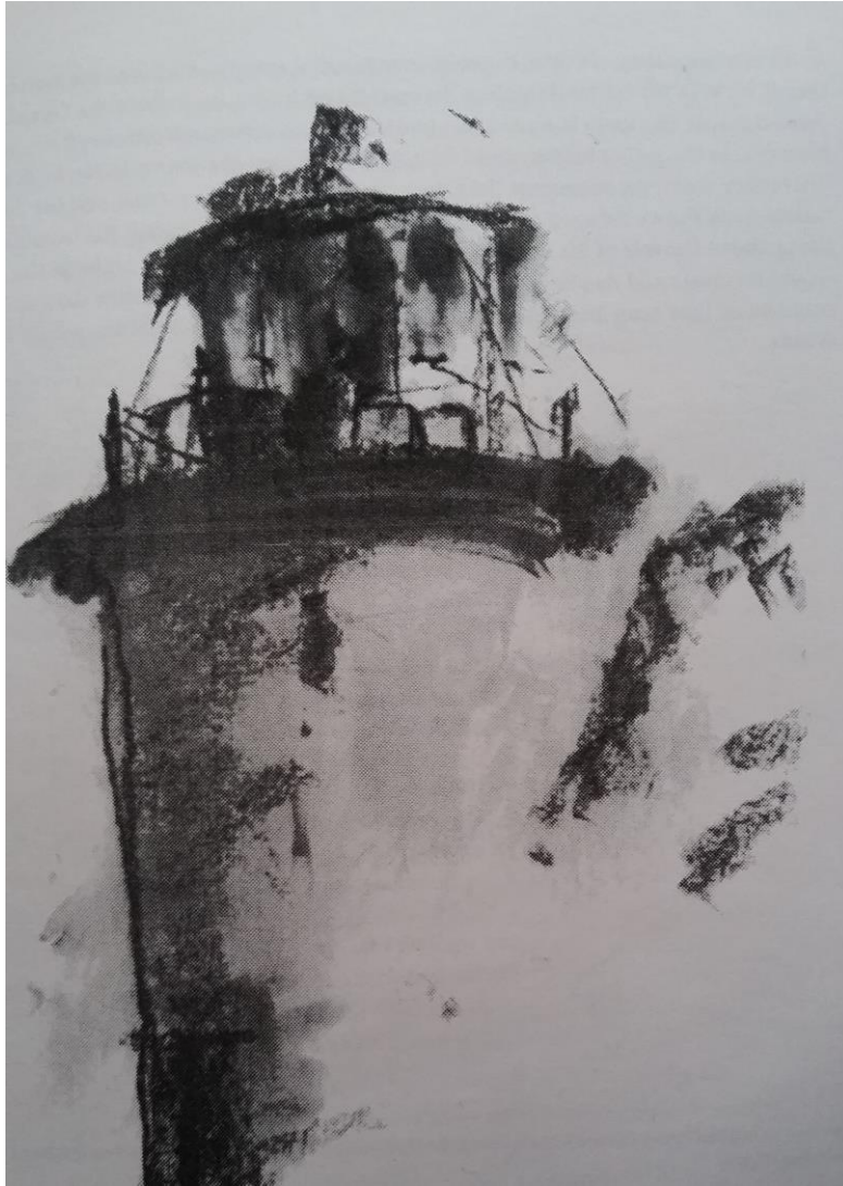
Painting 7. The Lighthouse. Tammy Love

I end with the Lighthouse--house of light--what better symbol for the imagination? It is a painting that sits upon the wall above the table at which I eat. It is located on False Duck Island, off Prince Edward County some 40 miles from here. It was painted by Tammy Love who is an artist living in Bloomfield, Ontario. It has saved many fishing vessels from destruction in the sudden fierce storms which can arise in mid-November on a cold and shallow lake. And now it watches over me. There is no vertical support under the right-hand end of the turret, but none is needed. The very strength of the bold horizontal stroke assures us that support is there aplenty even if only barely visible in the mist and the spray. To me the lighthouse has a face: two sombre saucer-like eyes look out to the right like deep pools of infinite caring. Everything I need to know about a lighthouse has been captured in a few charcoal strokes. It is a wonderful image and it is the one I will leave you with.